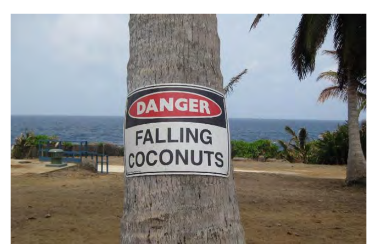
The Dangers of DX!

Now everything will hopefully get back to what passes for normal. There are quite a few events coming up and hopefully a lot of operators will be using what they learned from trying to be the one station that the DX operator picked out of the pile of the rest of the world calling.